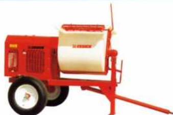
EasyClean™ models feature polyethylene drums.

Available in 7, 9, and 12 cubic foot capacities, with your choice of power and drum materials.