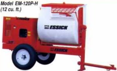
EasyClean™ models feature polyethylene drums.