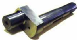
Heavier duty heat-treated billet steel crankshaft

It is equipped with powerful dependable engines (Diesel or Gasoline) and a heavy duty centrifugal clutch. It also uses the hinged manifold locking system, a centralized lubrication system and piston lubricating box which allows smoother pumping, easier clean-up, faster set-up and higher dependability.